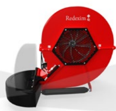
Adjustable reverse spout